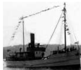
Left: ss Allenwood.